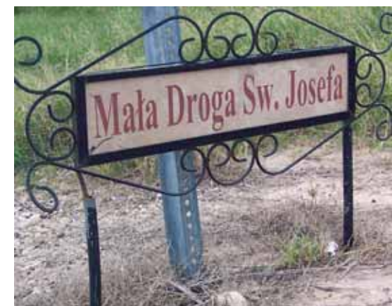
"Little Path of St. Joseph." The sign is a prayer for those leaving the driveway to St. Joseph to protect them on their way.

As recent history witnessed, 2006 was a severe drought year,